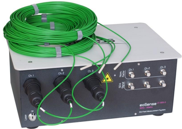
eoSense instrument with 3 eoProbe

Electromagnetic measurement systems, composed of eoSense instruments on the one hand and on eoProbe optical probes on the other hand are based on Pockels effect. This latter effect occurs in some optical crystals, called electro-optic (EO) crystals, and manifests itself as an E-field induced modification of the eigen dielectric axes of the EO crystal. An EO crystal behaves like a waveplate for a laser beam passing through it. Under applied E-field, the dephasing induced by the waveplate is modified in proportion to the field strength. This occurs through the E-field induced variation of the refractive indices of the EO crystal.